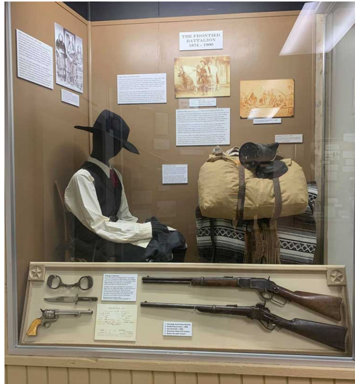
Top: The Frontier Battalion 1874-1900 Below: Texas Rangers During Prohibition 1920-1935

Beginning in early 2020, the TRHFM Collections Department began an ambitious project of updating exhibit content and displays. Scheduled for completion this month, Morris Gallery has been completely updated with new artifacts and exhibits. Morris Gallery details the vast history of the First Century of the Texas Rangers, from the Texas Revolution in 1835, Prohibition and its repeal, invention of the automobile and its popularization by outlaws, to the corrupt administrations of Governors Miriam "Ma" and James "Pa" Ferguson and the formation of DPS in 1935.