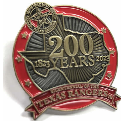
Official Texas Rangers Bicentennial Pin

Please click here to learn more about the program.