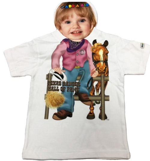
"Add a Kid" Cowgirl T-Shirt, Youth Kids 2T, 3T and 4T $16.00 + Tax