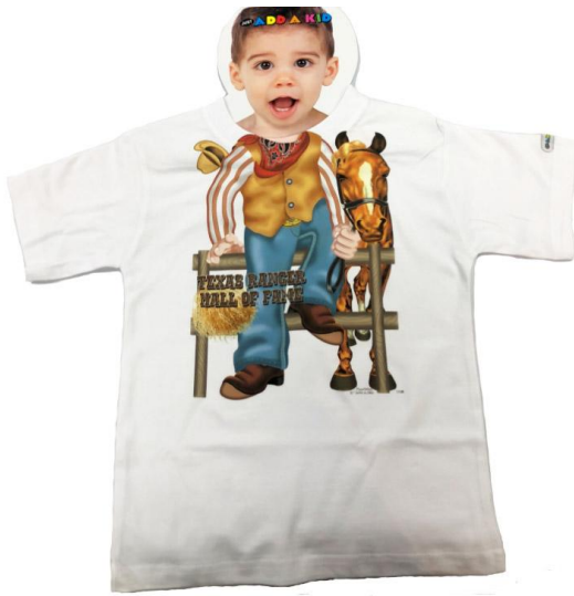
"Add a Kid" Cowboy T-Shirt, Youth Kids 2T, 3T and 4T $16.00 + Tax