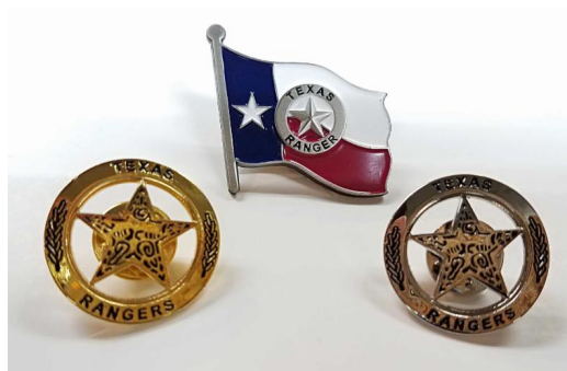
Flag and Badge Enamel Lapel Pin $6.95 + Tax

Sales from the Gift Shop benefit the preservation and education activities of the Museum. Please call (877) 750-8631 or email thestore@texasranger.org to order. Thank you!