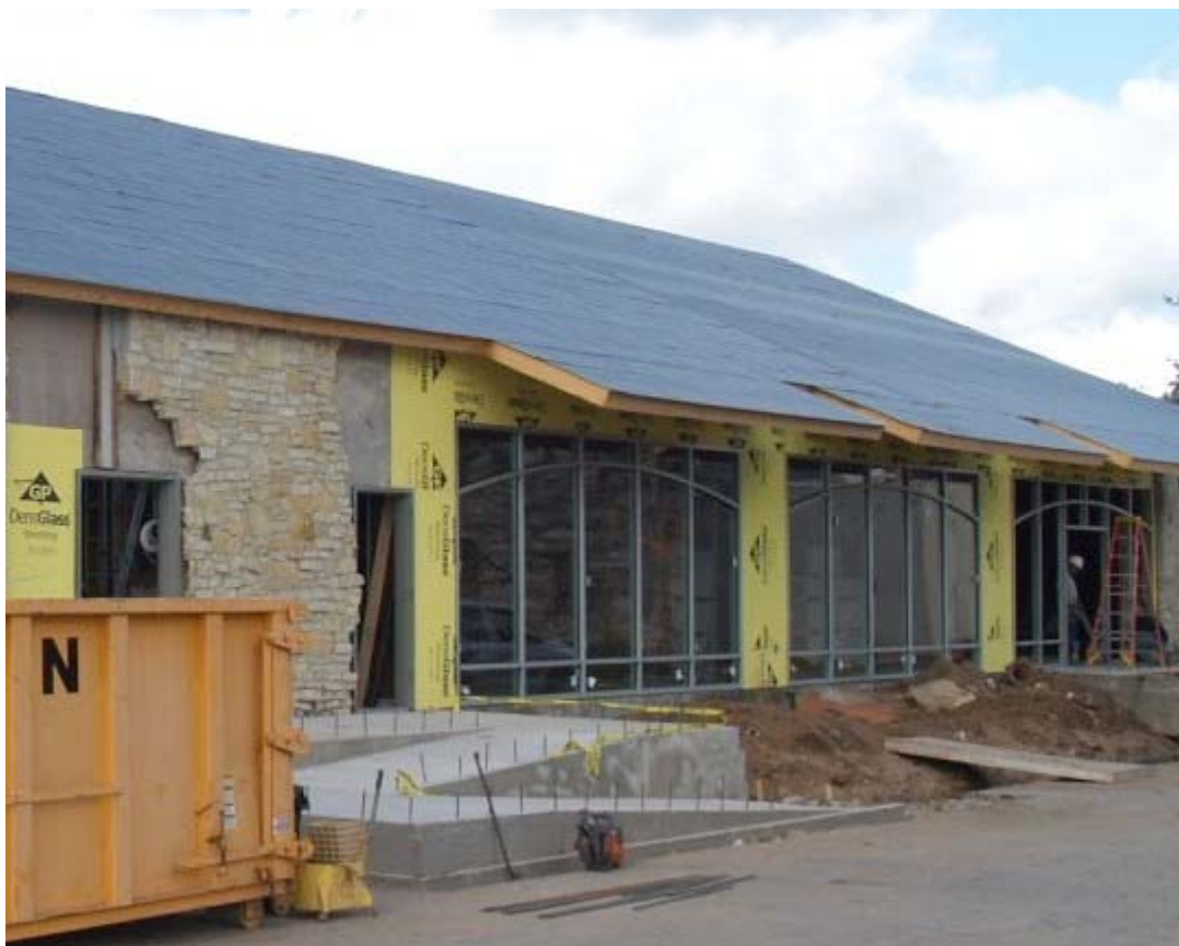
John Knox Texas Ranger Memorial Center