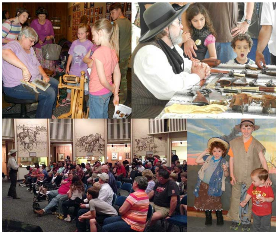
Photographs from Spring Break Round Up 2014.