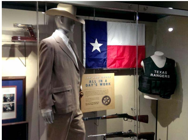
Distinguished Service Exhibit

The Armstrong Texas Ranger Research Center saw a 38% increase in research requests over 2013. Part of this is no doubt due to the increasing popularity of family genealogy. Staff assisted producers with television segments shot for PBS, History Channel, CSpan and American Heroes Channel (Discovery). The Armstrong Center also assisted Texas DPS in creating a memorial to Texas Rangers and Troopers killed in the line of duty.