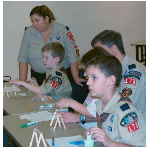
Cub Scout Pack 173 participated in the CSI program on January 12th.

Today the Texas Rangers are an elite crime investigation force. With state-of-the-art equipment at their disposal, the Texas Rangers piece together clues and solve crimes. An educational program of the museum makes it possible for students to learn about their use of modern forensics.