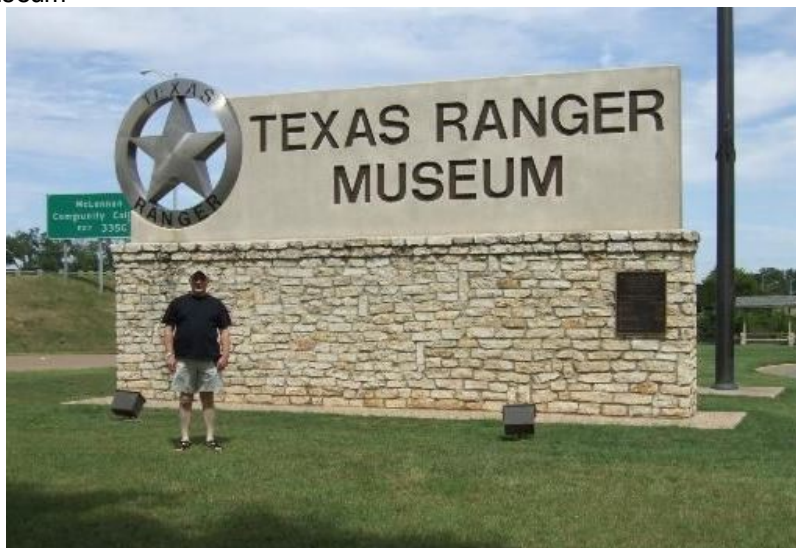
Original Monument Sign

'Tis the season for gifts! The Museum Gift Shop asks that all orders be placed by Saturday, December 17th for guaranteed Christmas delivery. Thank you!