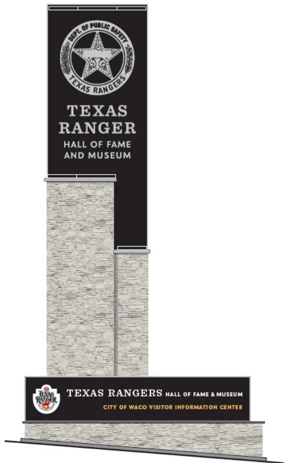
Artist's concept of new monument sign.