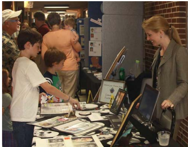
Forensic display at the Diamond Jubilee

It was a huge success with what looked to be around 3,000+ persons attending despite temperatures topping 105 degrees.