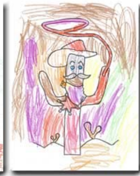
Third Place Jayden, 5