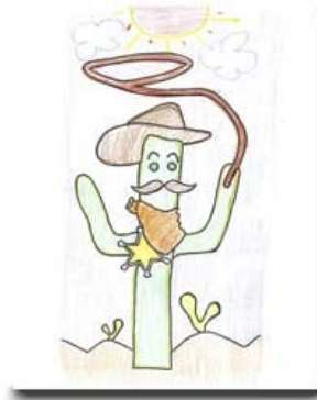
First Place Alexis, 14