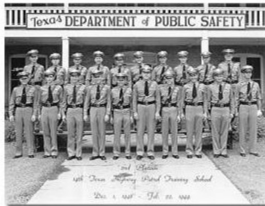
1949 Highway Patrol Training Class

The Texas Highway Patrol began in 1929 as a small group of 50 patrolmen. Although they had full police authority, officers were discouraged from using their authority beyond the enforcement of the state's traffic laws and assisting stranded motorists. After becoming a part of DPS in 1935, the Highway Patrol officer's duties were expanded to allow them full use of their police authority. The Highway Patrol was divided into 12 districts and expanded their force to include 235 patrolmen.