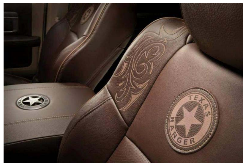
Top: Edition inlay on dash panel. Middle: Cinco Peso coin inlay on doors. Bottom: Leather seats feature stylized badge and Western elements.

Please click here to read more about the finishes on the Ram Texas Ranger concept truck and Ram's support of the upcoming