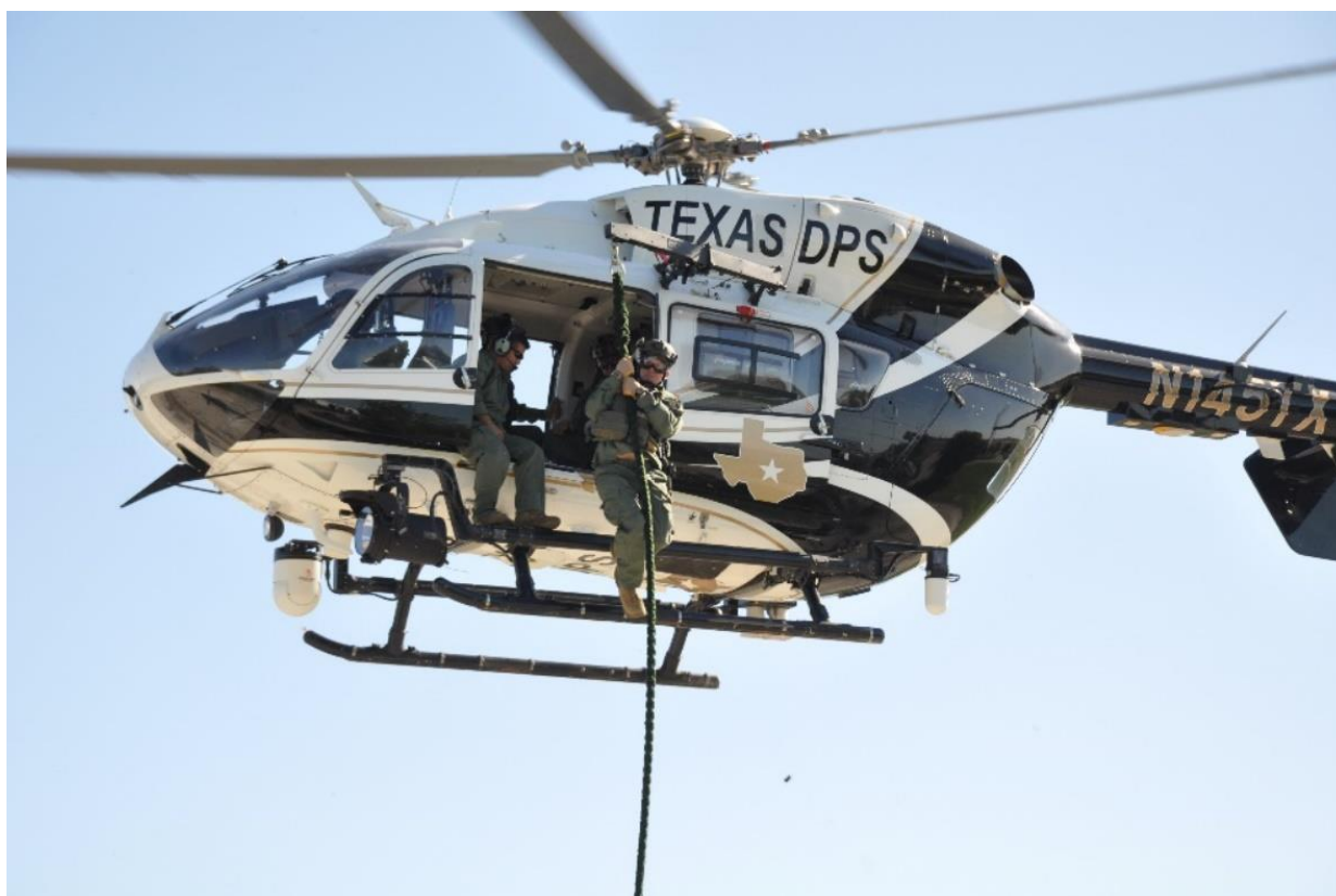
Texas Rangers practicing helicopter drills in 2013.